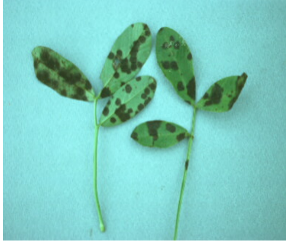
Figure 2. Late leaf spot- Cercosporidium personatum