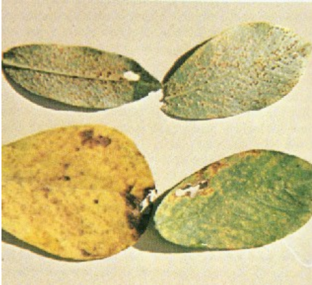
Figure 3. Peanut rust- Puccinia arachidis