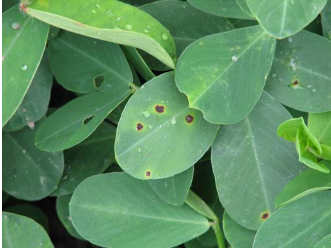
Figure 1. Early leaf spot- Cercospora arachidicola